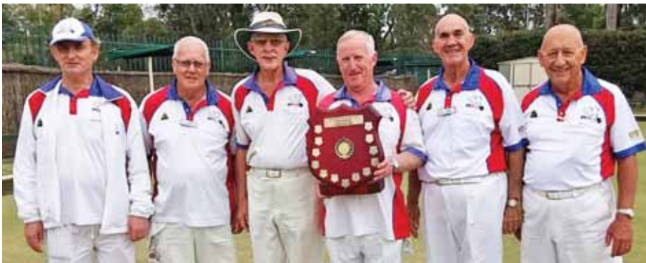
2015 MAJOR TRIPLES CHAMPIONSHIP