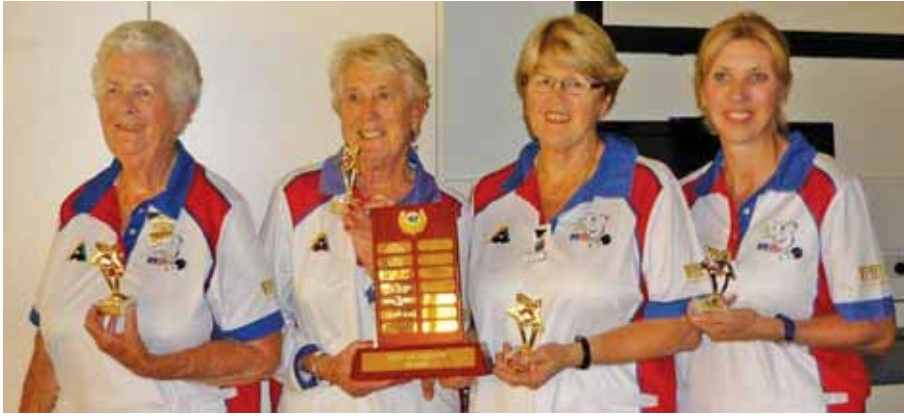
WINNERS OF THE DISTRICT PAST PRESIDENTS TROPHY 2015