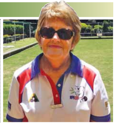
2015 WOMEN'S CONSISTENCY CHAMPION